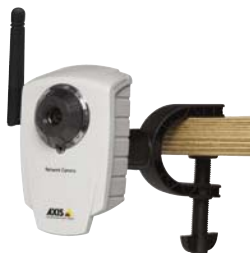
AXIS 207/207W/207MW Network Camera with flexible clamp - clamp included