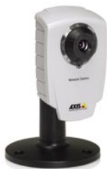
AXIS 207/207W/207MW Network Camera with camera stand - stand included