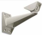
Wall mount bracket with ball joint (285 mm long)

The inside temperature of the housing is controlled which enables the camera to be operational under temperatures between +50°C and -20°C. this housing offers several mounting set-up possibilities: ceiling, wall, corner or post. Following accessories are necessary: