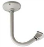
Ceiling mount bracket with inner cable path