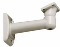
Wall mount bracket with inner cable path and ball joint