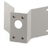
Corner adaptor for wall mount bracket